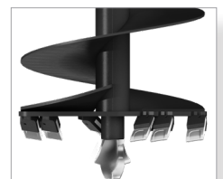
Enlarged view of bit

www.SidneyAttachments.com 866-567-9618 | 913-495-4861 16000 W. 108th Street, Lenexa, KS 66219